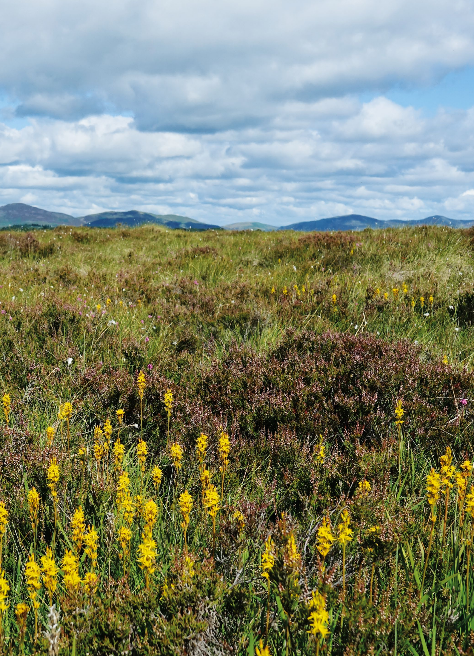
Near-natural bog (© Emma Goodyer)