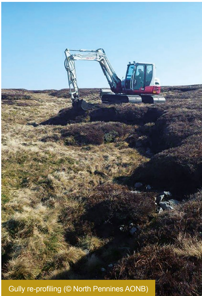
Gully re-profiling

Peatland Carbon Units are only available to purchase from Peatland Code projects in the UK; the Peatland Code Registry on IHS Markit, now a part of S&P Global, displays all projects and available carbon units. Buyers can also employ a carbon broker to actively search for a suitable project on their behalf. A non-exhaustive list of brokers is available on the Peatland Code website: www.iucn-uk-peatlandprogramme.org/peatland-code/introduction-peatland-code/useful-links . The IUCN UK Peatland Programme does not sell Peatland Code units.