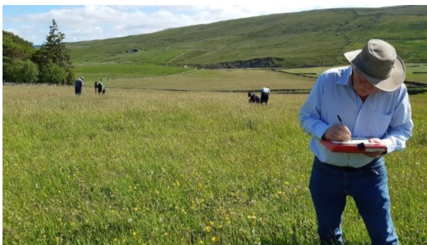
Meadow assessment 2022