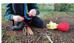
Scouts and cubs